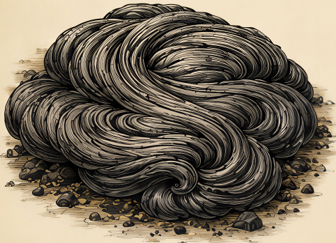
Pāhoehoe smooth ropy lava