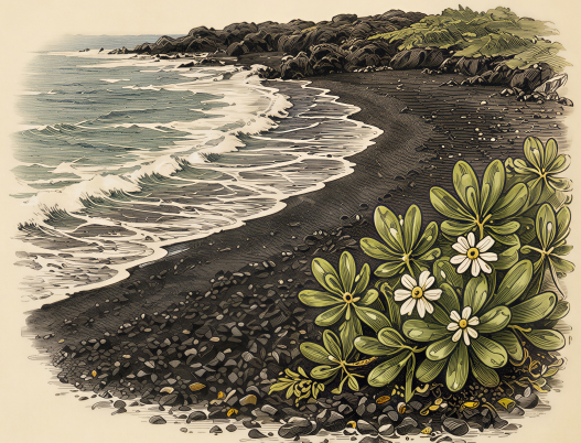
Black sand beach