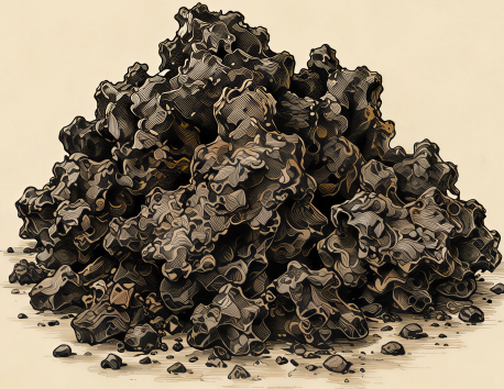
'A'ā rough jagged lava